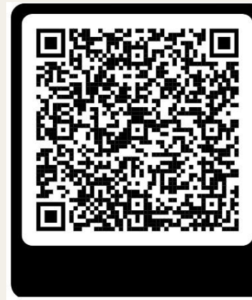
QR: Application form